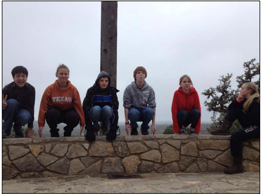
Middle School Midwinters Group Picture