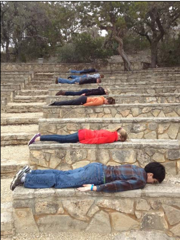
Middle School Midwinters Group Picture