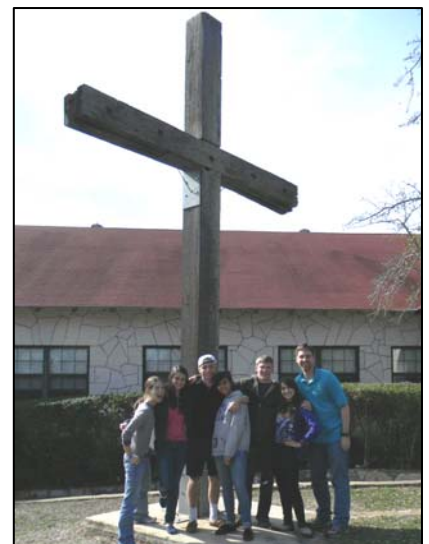
High School Midwinters Group Picture